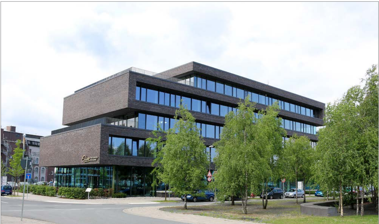
Head office abat

abat was once again awarded by TopJob as one of the Germany's best employers in 2017 in its size class. The company also carries the seal of quality TOP-Company and OPEN-Company of the job evaluation platform kununu.com.